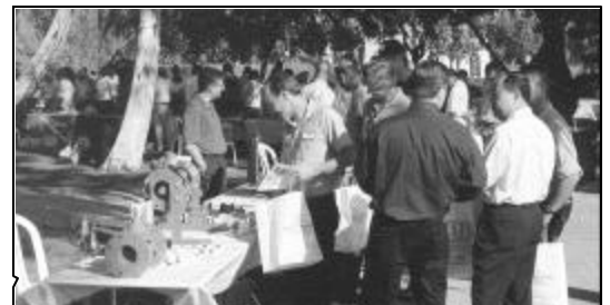
A BIG thank you goes out to all those who helped make the vendor fair a success!

Thanks to our co-sponsors, In-N-Out burgers were provided for everyone. The attendees had a great time networking, talking and learning about various products with the vendors. Due to the response, we will probably have a 3rd Product Fair.